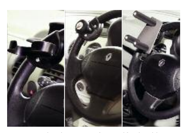
Steering wheel spinners from Alfred Bekker

Spinners come in several shapes and sizes to suit different types of grip. Most cost between £10 and £110.