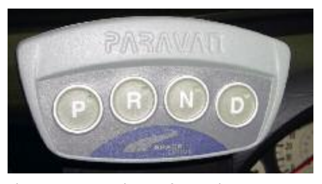
Electronic gear selector, from Adaptacar

If you cannot use a mechanical gear selector, you can have an electronic system fitted, but these can be expensive. Take advice from a Mobility Centre before investing in one of these systems.