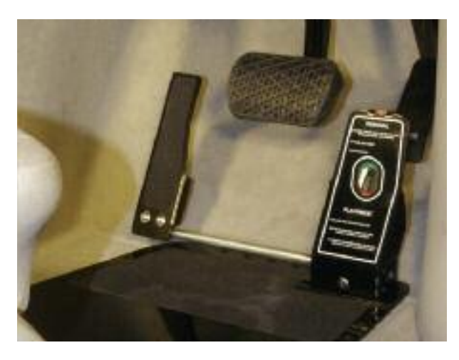
Removable left foot accelerator, from Brig Ayd

If your right leg is affected and you cannot use the accelerator pedal, you can fit a left foot accelerator, for around £400. So that other people can drive the car, these are removable or made so that you can flip the other pedal down.