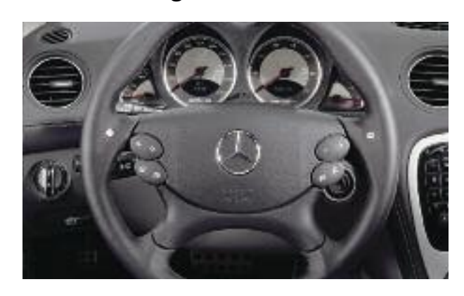
Gear controls on steering wheel

Some cars have automated manual gear systems which work without using a clutch pedal. You move a lever to the right setting or push buttons or paddles on the steering wheel.