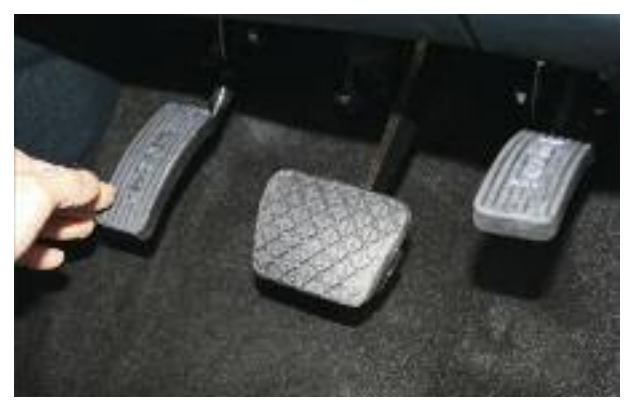
Flip-up left foot accelerator, from Jeff Gosling