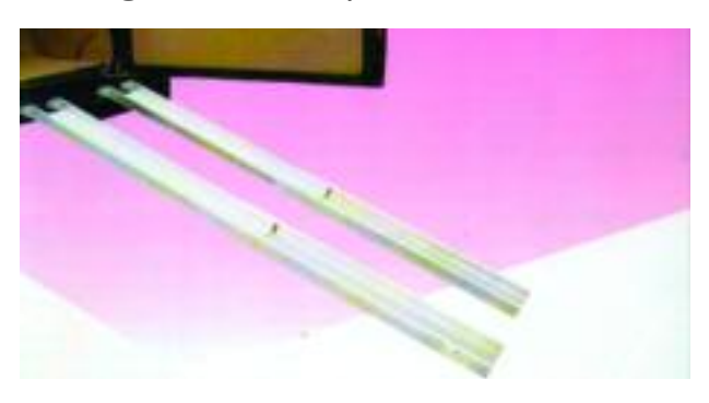
Telescopic ramps. About £100 – £500