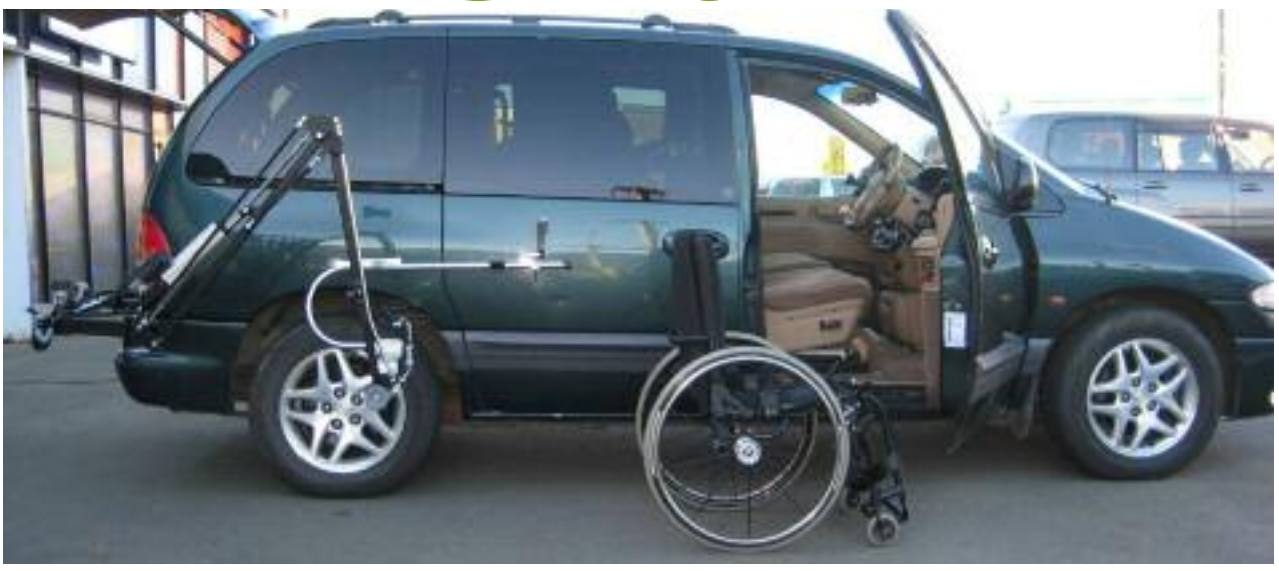
AbiLoader, available from Steering Developments, from £9,300 fitted (see page 19)

These systems make it possible to stow a manual wheelchair in the car (boot or back seat area) or on the roof after you have transferred onto your seat. You don't need help to do this, and you don't need to be able to walk round the car.