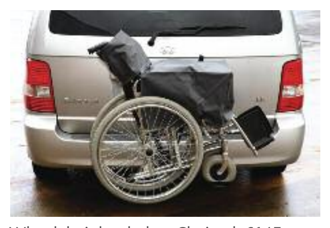
Wheelchair loaded on Chairack £145

In both cases, you may need a lighting board and number plate if the one fitted to your vehicle is obscured.