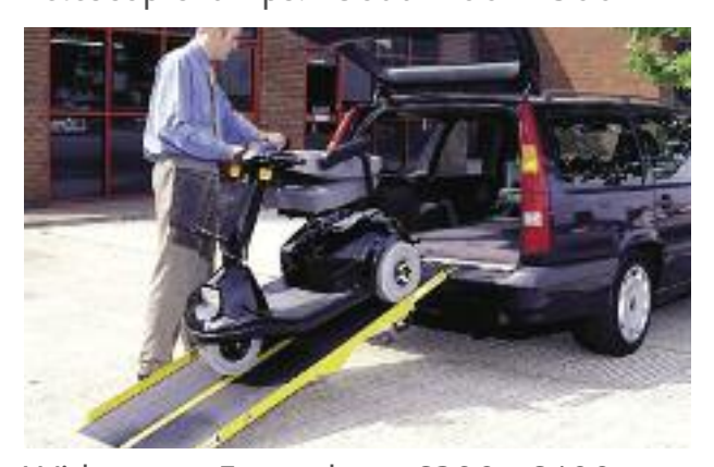
Wide ramp. From about £200-£400