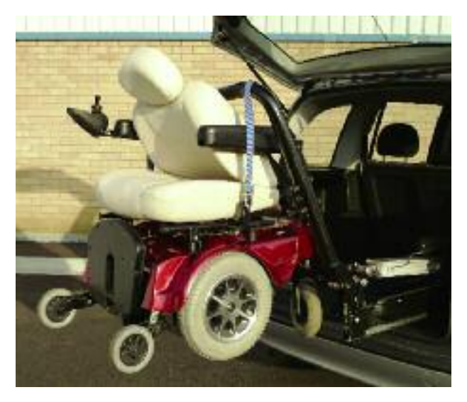
Four-way hoist from Brig-Ayd, £1,530

You will probably need to use both hands to use the hoist. You also need to be able to stand without much support while you are hooking on and lifting the wheelchair.