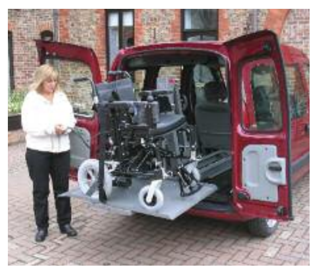
Platform lift from Alfred Bekker, £1,998

Information about currently available hoists is given in the tables on pages 14–17.