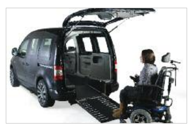
I Can from Sirus Automotive from £33,295

Specialist firms convert MPVs, vans and other vehicles so that you can get in and travel in your wheelchair. If you travel as a passenger you usually sit behind the front row of seats, but some designs allow you to sit beside the driver.