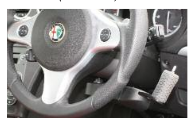
Jeff Gosling single lever accelerator and brake – here fitted with optional indicator switch

Push pull controls combine acceleration and braking in one lever – mounted on the steering column or on the floor (£400-£900).