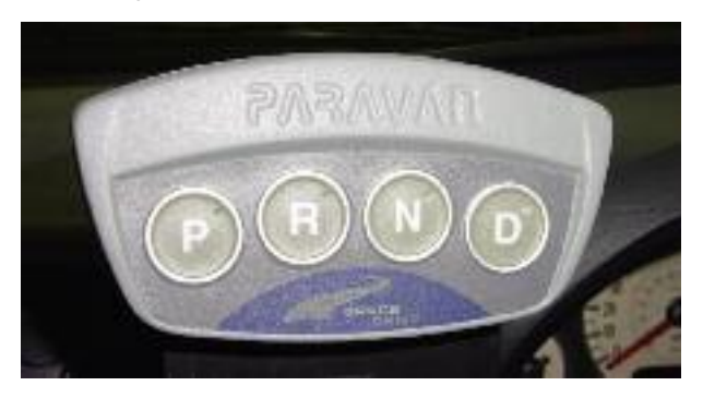
Electronic gear selector, from Adaptacar

Usually automatics have a mechanical gear selector. If this is too hard for you to use, you can have an electronic system fitted, but these can be expensive. Take advice from a Mobility Centre before investing in one of these systems.