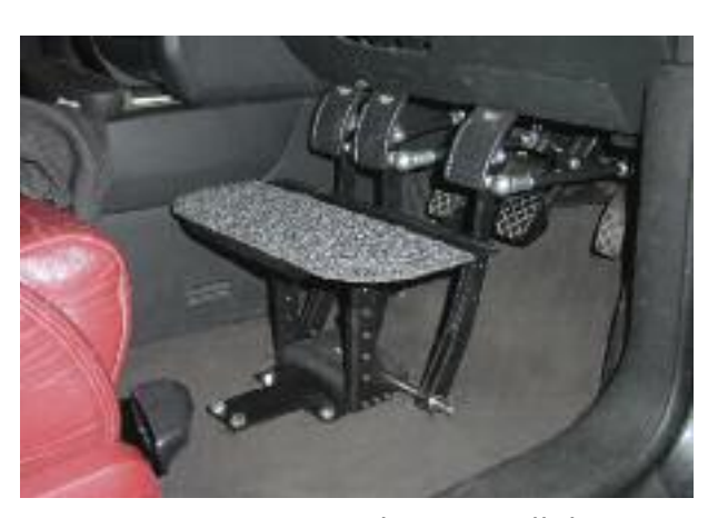
Menox Stamp extension kit raises all three pedals – from £680 fitted from Autoadapt

Changing gears – Automatic transmission means fewer gear changes and helps with pulling away, especially in hill starts.