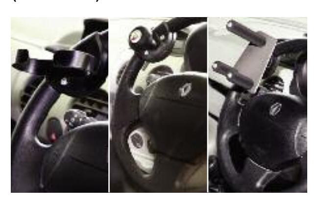
Steering wheel grips from Alfred Bekker

Spinners come in several shapes and sizes to suit different types of grip (£15 - £110).