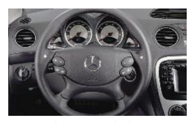
Gear controls on steering wheel

Some cars have automated manual gear systems which work without using a clutch pedal. You move a lever or use push buttons or paddles on the steering wheel to select a gear.