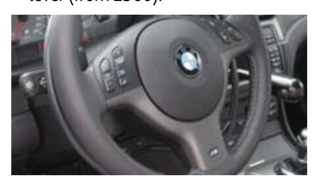
Under ring accelerator

Separate controls for the accelerator and brake give you more choice and may need less effort. An under ring accelerator (from £1,800) lets you steer with both hands. This is normally combined with a hand-operated brake lever (from £360).